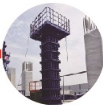
浇筑振捣 Pouring and vibrating