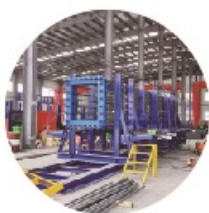
钢筋笼绑扎 Reinforced cage lashing