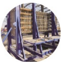
灌浆套筒安装 Grouting sleeve installation