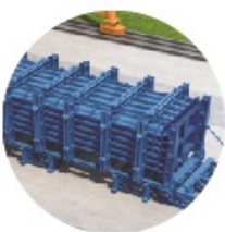
钢筋笼安装及 模板安装 Rebar cage installation and horizontal installation