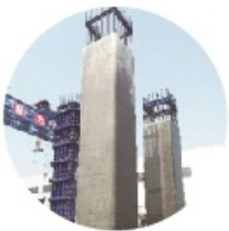
浇水养护 Watering maintenance