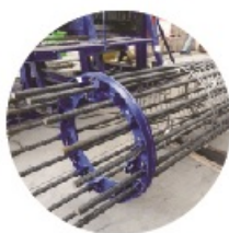
钢筋存放及加工 Rebar storage and processing