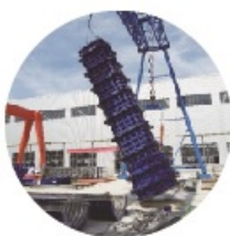
模板安装就位 Horizontal version installed in place