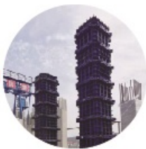
拆除操作平台 Dismantle the operating platform